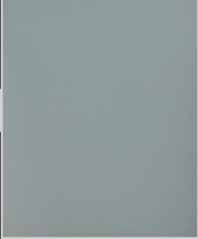
Glass Paint Water Base Clear Texture Finish