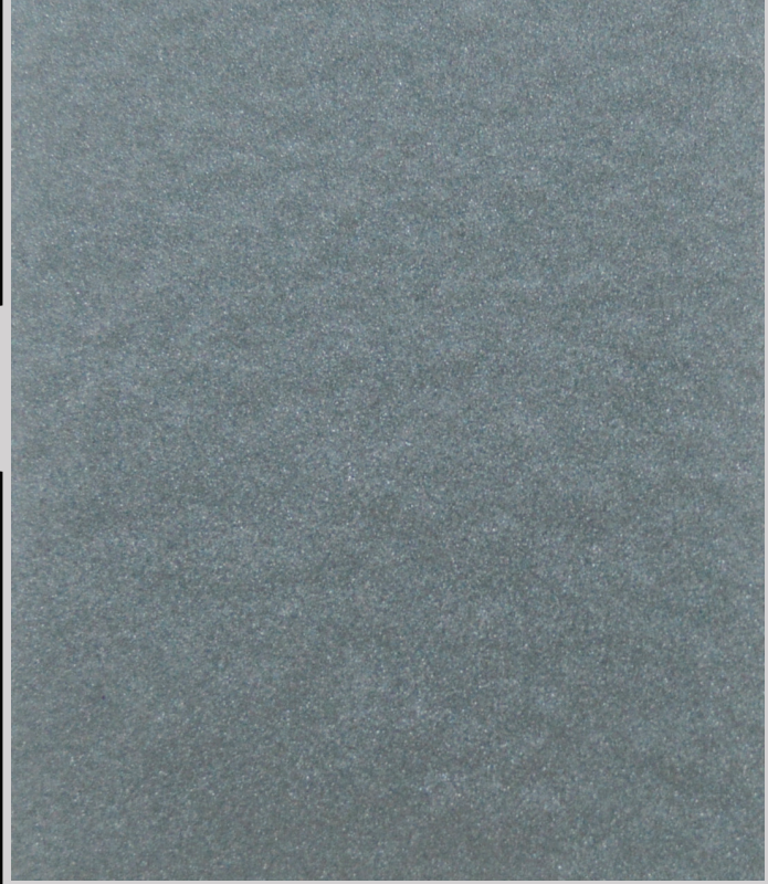
Glass Paint Water Solvent Base Silver Metallic